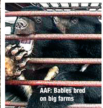
AAF: Babies bred on big farms