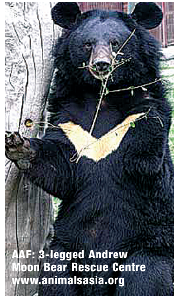
3-legged Andrew Moon Bear Rescue Centre www.animalsasia.org