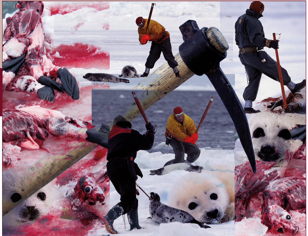
PHOTO COLLAGE , poster-size original created by Kinship Circle. CREDITS: Sea Shepherd Conservation Society; IFAW, yellow jacket sealer clubbing; IFAW, rolling over seal; Reio Hara & IFAW, harp whitecoat babies. www.harpseals.org/toolbox/xtolbox1.html#kill

Men bludgeoning fuzzy-wuzzies? In Canada the harp seal is no cute critter. He is the official scapegoat for a depressed fishing industry.