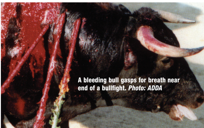
A bleeding bull gasps for breath near end of a bullfight.