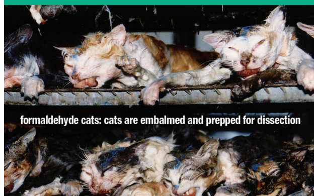
formaldehyde cats: cats are embalmed and prepped for dissection