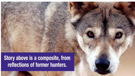
Story above is a composite, from reflections of former hunters.

But he knew better. Stealing the life of an animal is probably a pretty lame excuse for a sport. Maybe a "real man" sees the pain in a dying animal, along with the grief of another animal who cares for her... He decided to hone his golf game and play more softball with his kids. Those are real sports. He'd leave hunting to the losers.