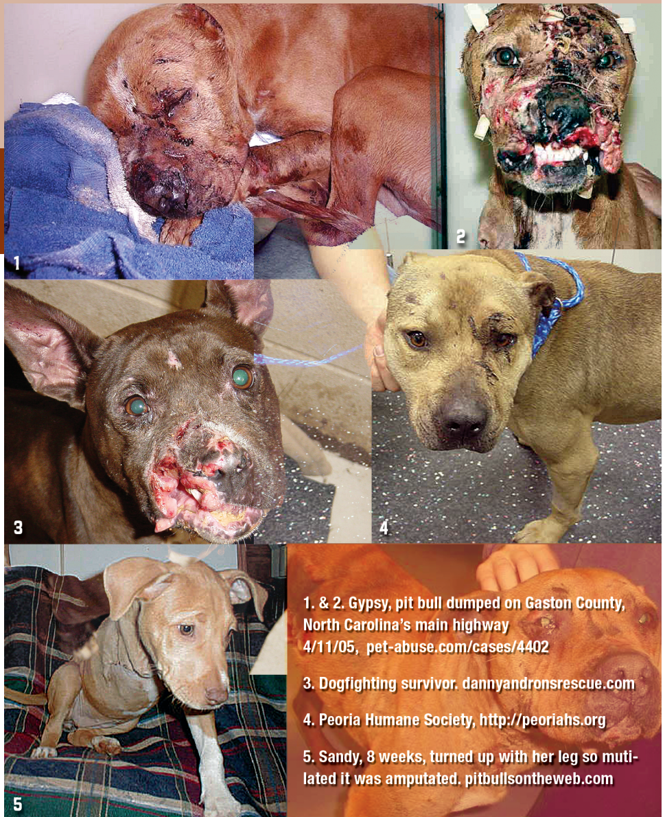
1. & 2. Gypsy, pit bull dumped on Gaston County, North Carolina's main highway 4/11/05, pet-abuse.com/cases/4402

During matches that last two or more hours, dogs paired by weight are situated behind "scratch lines" etched on either side of a soft-surface pit. A referee orders each handler to "face your dog." Upon the "let go" command,