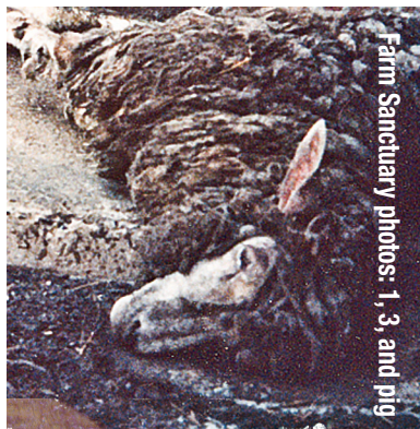
Farm Sanctuary photos: 1, 3, and pig

Perhaps, but it's a gamble. Nonprofit humane groups — not federal watchdogs — expose most animal welfare and food security breaches. Westland/Hallmark is not a first-time offender. In 1993, the animal protection organization Farm Sanctuary filmed Hallmark workers shoving cows with forklifts. Two California groups uncovered 11 verified instances of abuse at Hallmark between 1996