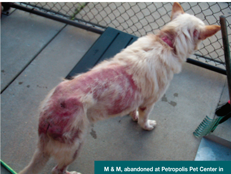
M & M, abandoned at Petropolis Pet Center in Chesterfield, MO with sarcoptic mange.

Some aren't as fortunate as M & M. The Humane Society of the U.S. (HSUS) describes one tethered dog whose collar, an electrical cord, grew so embedded in his neck the plug was no longer visible. A veterinarian could not remove the device and had to euthanize the dog.