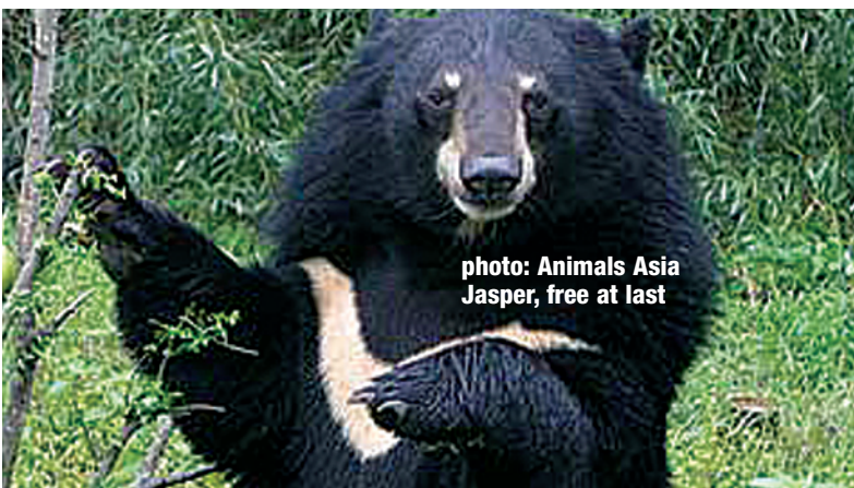
Jasper, free at last